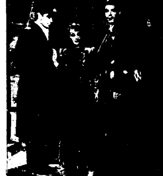
An air-warden in bomb-battered London gives the "all clear" signal in this scene from "One Night in Lisbon" which comes to the Punch and Judy Theatre this Friday thru Monday.