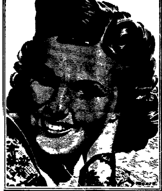
DEANNA DURBIN in "The Amazing Mrs. Holliday" scores one of her most impressive successes in the Univeal picture that titles at the Esquire Sunday and Monday.