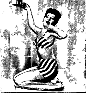
LOVELY JEAN ARTHUR—Whether she is under the glow of candle light or klieg lights Jean Arthur remains one of Hollywood's most glamorous stars. This pose is for her newest picture, 'The Great Gatsby', which she will be co-starring at the Edouar Theatre with Joel McCrea and Charles Coburn on Tuesday, Wednesday and Thursday.