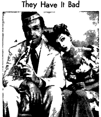
MARY MARTIN and DICK POWELL are that way about each other in Paramount's new musical, "Happy Days with Mary Martin and Dick Powell." Lucky the Technicolor comedy which plays at the Equinox on Tues.-Wed. Thurs.

Great New Show at Club Royale Strike up the band and get the largest crowd to see the new show at the Club Royale. It is a new and different kind of show, one that will give you a new and different kind of entertainment.