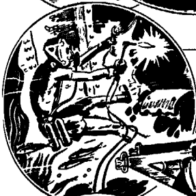
Diving masks and related equipment made by ORCO are in use by U S Navy men everywhere.