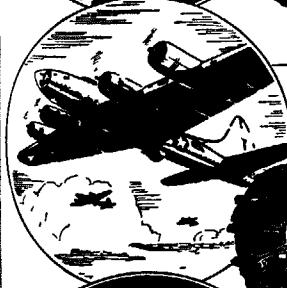
More than 150 different parts for airplane engines are made by The Ohio Rubber Company (ORCO).