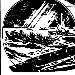
Two man and Eight man Kayaks made by ORCO land our fighting men on enemy shores.