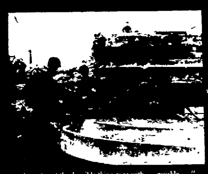
... to get this horrible thing over with ... quickly ...

This Page Contributed to America's All-Out Effort for Victory by the Following Members of the Grosse Pointe Rotary Club