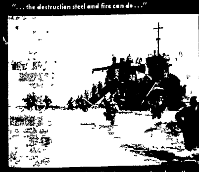
... the destruction steel and fire can do ...