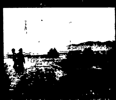
... and claw their way into a hostile coast." (Sicily)