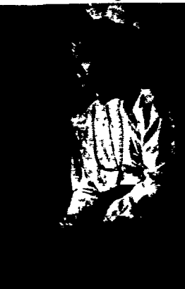
ANN SHERIDAN who is co-starred with Errol Flynn in "Edge of Darkness" on the Equinox screen next Tuesday, Wednesday and Thursday.