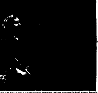
With all the nerve-shattering tension of an unexpedited time bomb "They Came to Blow Up America" will tick off 80 minutes at the Lakewood Theatre on East Jefferson avenue at Lakewood next week.