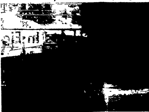
The store of the Grosse Pointe Drug Company, at Kercheval and St. Clair which has been partially closed because of a recent fire, has been completely redecorated and is observing a big Fall opening this weekend and all next week with fresh new stocks and the service for which this store has always been famous.