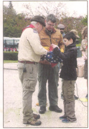
A worn flag is prepared for retirement.

Saturday, Oct. 3, members of the Louisa St. Clair Chapter, Daughters of the American Revolution, with the John Paul Jones Society, Children of the American Revolution and Grosse Pointe Troop No. 96, hosted their annual flag retirement ceremony at Farms Pier Park. The community was invited to attend.