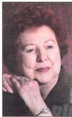
Margaret Mary Chariot