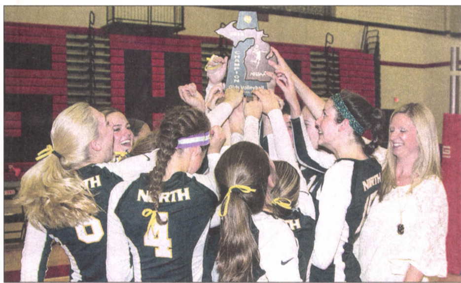
North coaches and players hoist the district championship trophy after sweeping host St. Clair Shores Lake Shore.