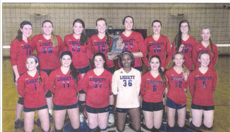
The University Liggett girls' volleyball team members pose with a Class C district championship trophy.